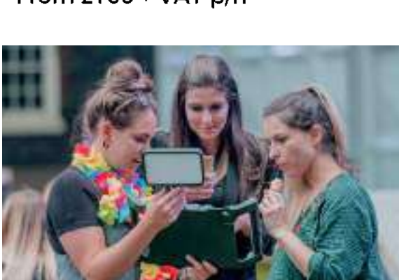
Snappit £500 + VAT Up to 4 hrs set Additional hours: £70 + VAT p/h per operator