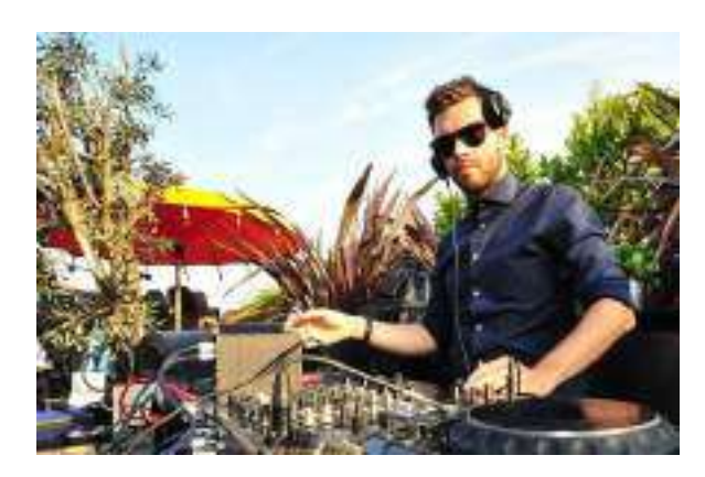
DJ from £675 + VAT 4 hrs set, incl. PA and lights for upto 200 Additional hours: From £100 + VAT p/h