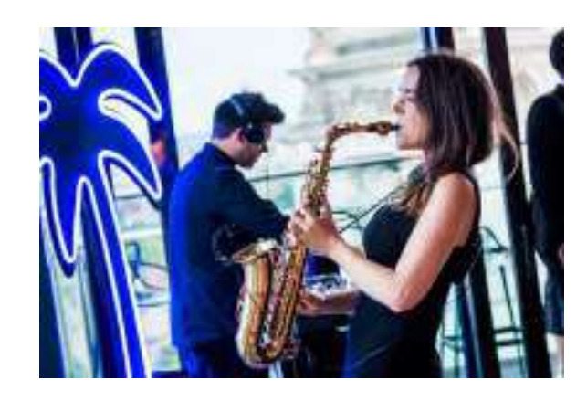
Beats Boutique £1550 + VAT 3 x 30 mins sets Additional hours: £300 + VAT p/h for the trio