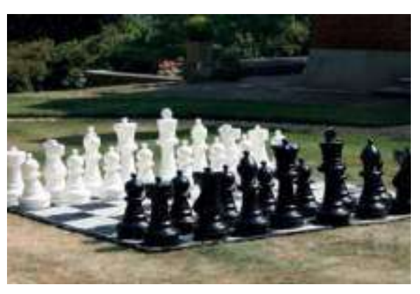
Lawn Games £475 + VAT Price per event 3 x games (for example Jenga, Connect 4 & Downfall)