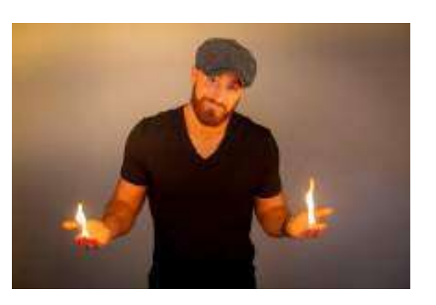
Magician from £600 + VAT 2hrs set Additional hours: From £135 + VAT p/h